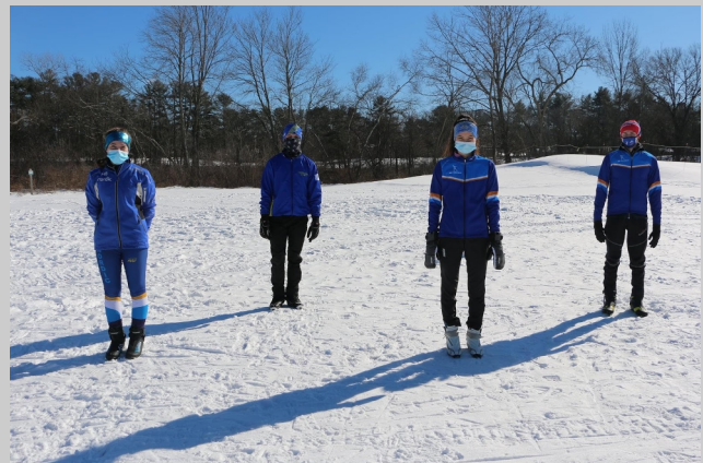
Pictured Above: AB Nordic Team Captains